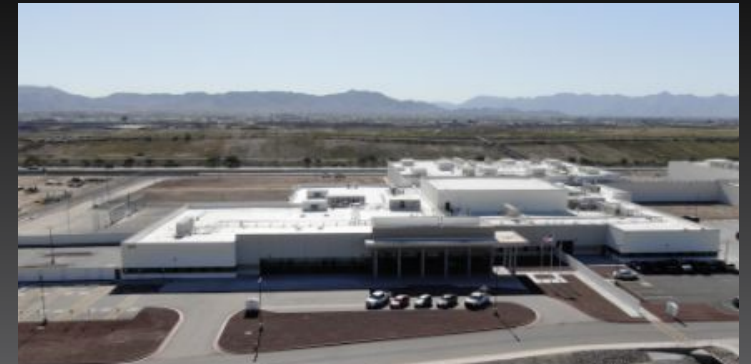
Intake, Transfer, and Release (ITR)