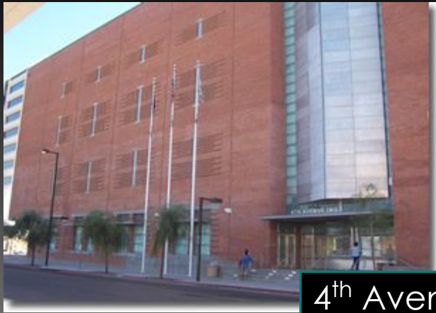
4 th Avenue